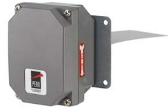
F262 Airflow Control